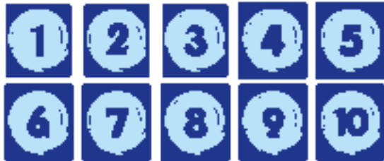
Numbered Hop Pads (2 of each number)