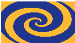
Double Hop Pad

PLAY: Take turns. On your turn, jump onto the Hop Pads in numerical order. If there's just one Pad of a number, you must land on it with only one foot. If there are two Pads of the same number, you must land with both feet at the same time, having one foot on each Pad. If Pads are sideways or upside-down, you must land with your foot (or feet) matching the direction of the number on the Pad. Hop all the way from number 1 to number 10, and then spin around and hop the course in reverse, from 10 back down to 1.