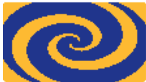
Double Hop Pad

CONTENTS: 20 Numbered Hop Pads, 1 Double Hop Pad and 1 Round Hop Pad